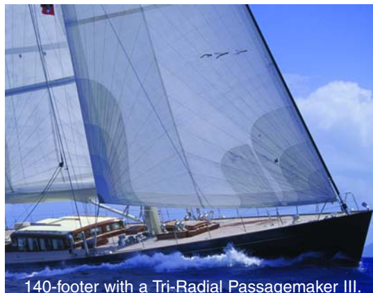
140-footer with a Tri-Radial Passagemaker III.

As the name implies, dependability is the Passagemaker's middle name. These genoas are built extra strong to provide all the advantages of a full luff genoa with the convenience being able to easily reef to a smaller genoa. UK-Halsey builds Passagemakers using three different constructions to meet your needs.